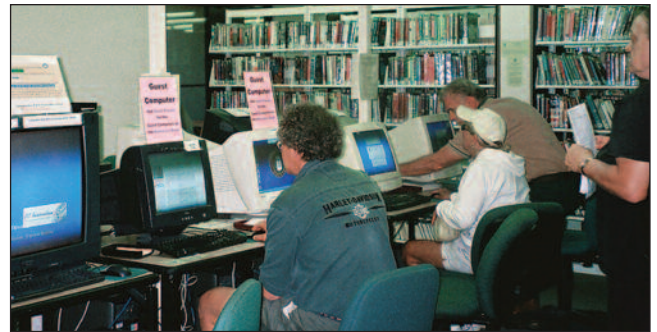
The former Friends of the Library Bookstore is now a place for public computers.